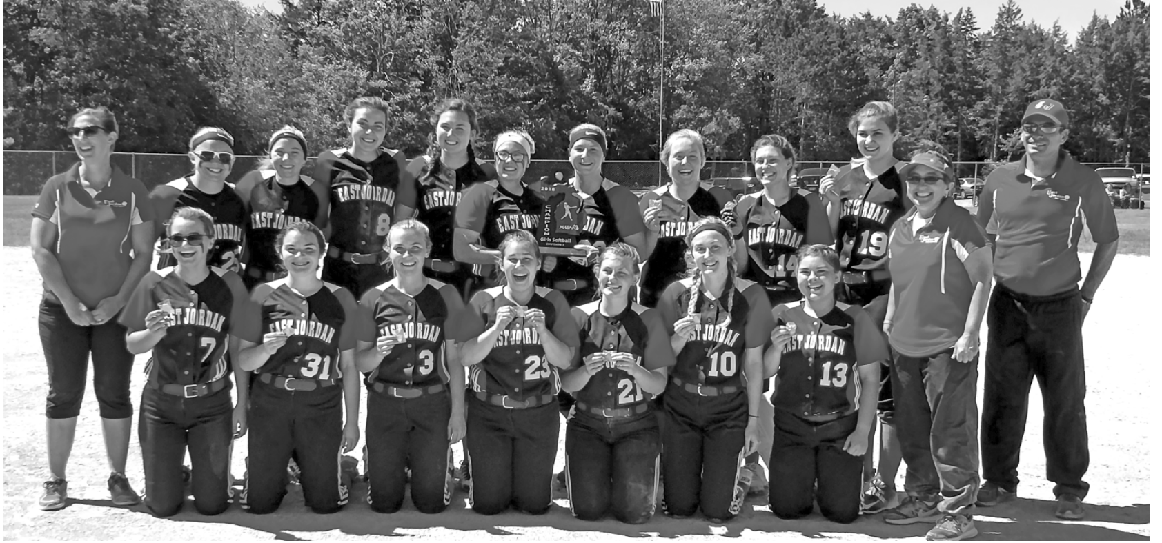
East Jordan softball team with their district trophy.

East Jordan advances to face Inland Lakes in the regional semifinal on Saturday, June 9. The game will be in Indian River.